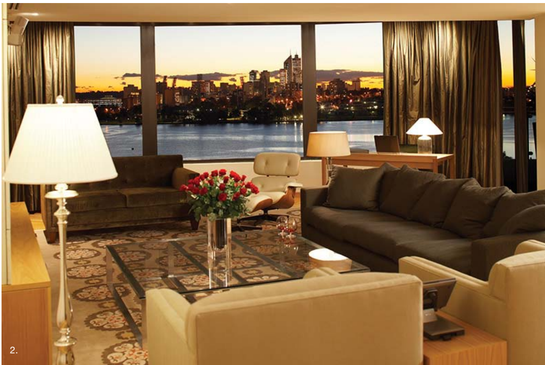
1. LIVING ROOM 2. LIVING ROOM