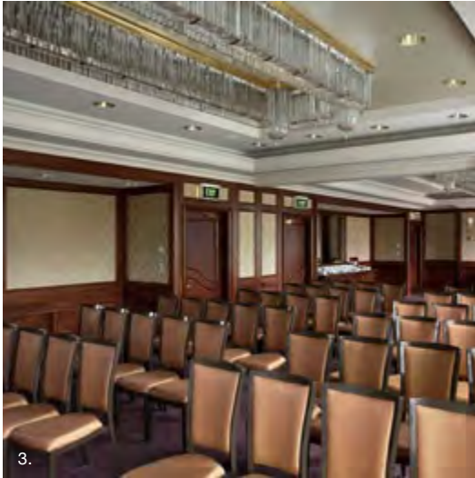
1. FLINDERS ROOM 2. FLINDERS ROOM 3. YARRA ROOM