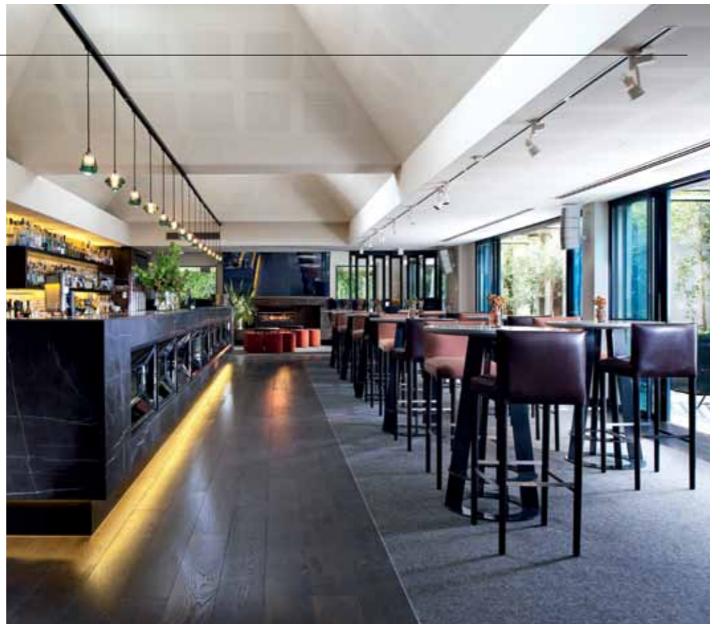
ABOVE The rear lounge features a marble-clad bar and other rich finishes

Annie Reid is a freelance writer based in Melbourne.